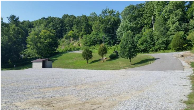
Parking area and restroom building