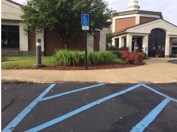
Curb ramp – from Northeast toward Entrance